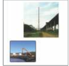
Rubber Component for ash slurry plants