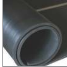
Rubber Insulating Matting