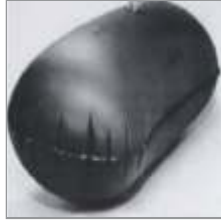
Rubber Air Cell